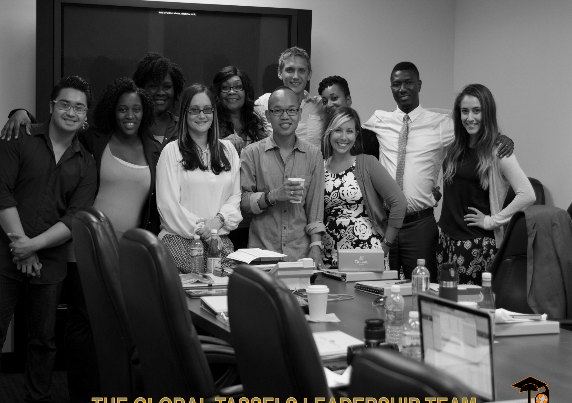
THE GLOBAL TASSELS LEADERSHIP TEAM